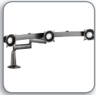
KCD320 Triple Monitor Swing Arm Desk Mount