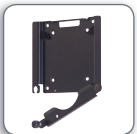
KSA1024 ■ Centris Quick-Connect Interface