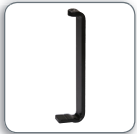
KSA1008 ■ Extended Desk Clamp Bracket - Compatible with 2.5 - 5" (64 - 127 mm) thick surfaces