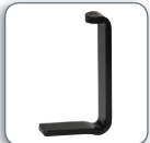
KSA1012 ■ Extended Reach Desk Clamp Bracket