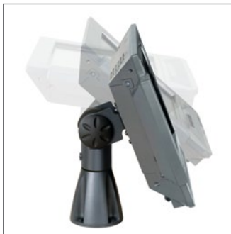
Easily tilt monitor to desired angle