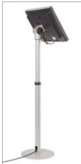
Internal cable routing