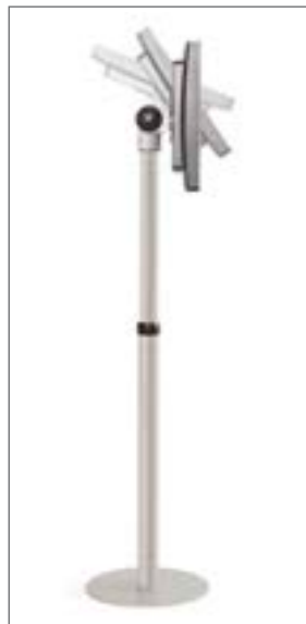
Tilt monitor or lock in place if desired