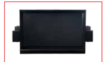
Wall units accommodate speakers when used with smaller screens

Peerless Industries, Inc. 3215 W. North Avenue, Melrose Park, IL 60160