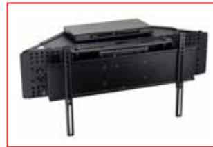
Optional shelf available for A/V components