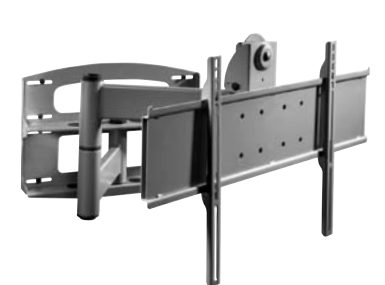
Universal model includes universal adapter plate

735029243212 PI AV60: PLAV60-S: 735029244776 PLAV60-UNL: 735029243311 PLAV60-UNL-S: 735029243328 PLAV60-UNLP: 735029243335 PLAV60-UNLP-S: 735029243342