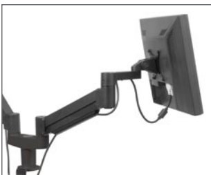
Integrated cable management reduces workplace clutter