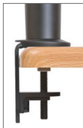
Clamp mount to desk edge, grommet or bolt through desk