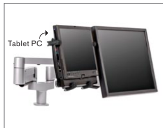
Also accommodates tablet PCs