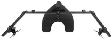
Articulating wings allow you to create the perfect viewing angle