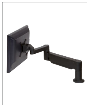
Rotates 360 degrees at three joints