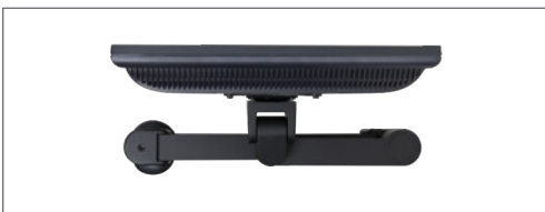
Folds flat to save maximum space