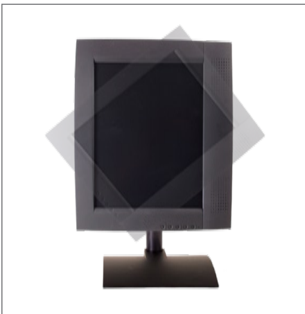
Monitor can pivot from landscape to portrait