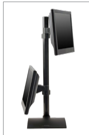
Adjust monitors independently