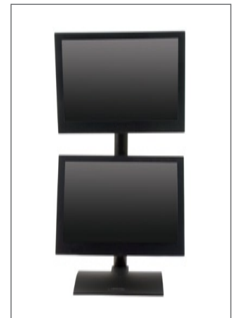
Ideal for touchscreen applications