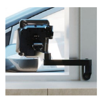
Increase flexibility by combining the wall mount with our optional extension arms

The PTS-WM-IPP320-350 supports the Ingenico IPP320 or IPP350 payment device.