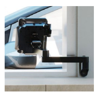
Increase flexibility by combining the wall mount with our optional extension arms

The PTS-WM-LANE supports the Ingenico Lane 3000, 5000, 7000 or 8000 payment device.